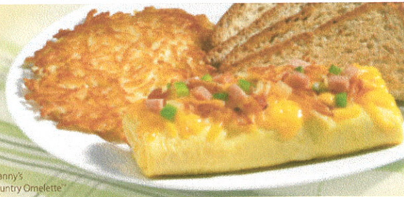
Granny's Country Omelette

Prepared with three Grade AA large eggs, served with hash browns or breakfast potatoes and choice of three buttermilk pancakes, fresh-baked Mammoth Muffin*, fruit or white, whole wheat or rye toast.