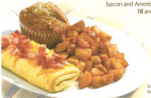
Smoked Bacon & Ham Omelette

Tender grilled, diced ham with smoked bacon and American cheese fill and top this omelette. 8.69