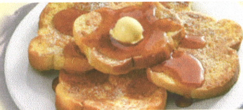
Ooh-la-la French Toast

Our world-famous pancakes are made-from-scratch with our own secret recipe batter and served with our Perkins® brand syrups. Sugar Free syrup is available upon request.