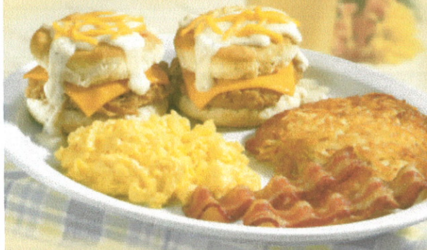
Southern Fried Chicken Biscuit Platter

Two fresh-baked biscuits filled with a fried chicken fillet and American cheese, topped with country sausage gravy. Served with two large eggs cooked to order, two smoked bacon strips and choice of hash browns or breakfast potatoes. (No accompaniments) 8.09